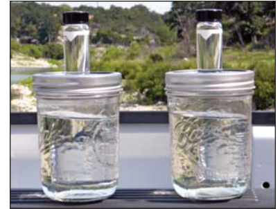
The effluent sample on the left, discharged from an Orenco AX100 Treatment System, is as clear as the water sample on the right, taken from a nearby lake.