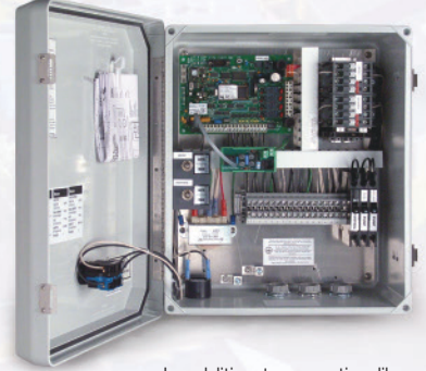
In addition to operating like other panels, the VeriComm Control Panel has four very "smart" functions: alarm management, data collection, troubleshooting, and advanced control logic. Operators can change settings at the panel from a PDA with Bluetooth®, or remotely via the web.