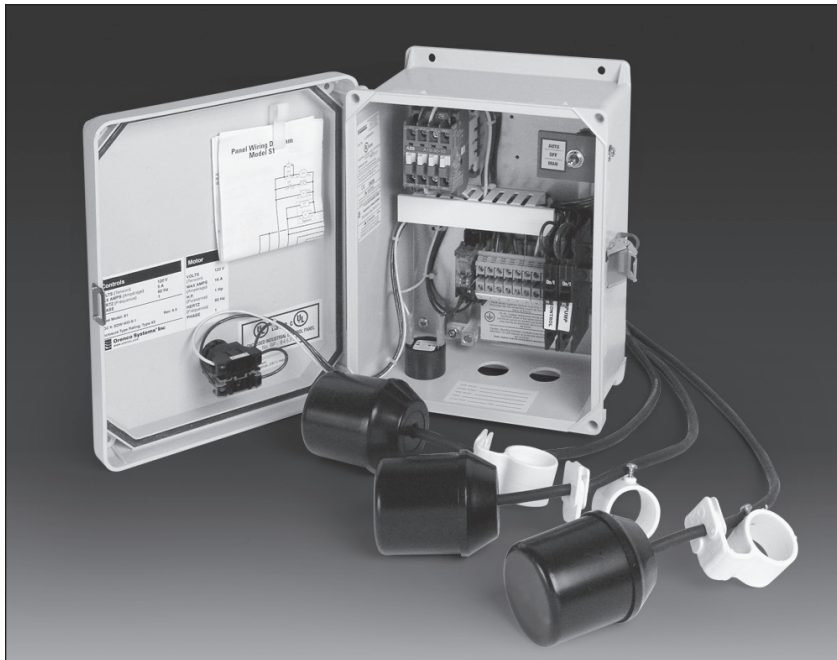
Orenco's Standard Panel Kits are a high-quality but affordable solution for on-demand pumping in water and wastewater applications.

The float collars quickly secure floats to a 1-inch-diameter float stem (ordered separately).