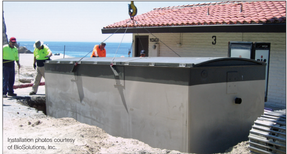
Installation photos courtesy of BioSolutions, Inc.