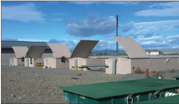
The Yakama Nations Housing Authority in Washington state added five AdvanTex® AX-Max units (background) to its ten AdvanTex AX-100 units, increasing the capacity of its wastewater system by 50%.