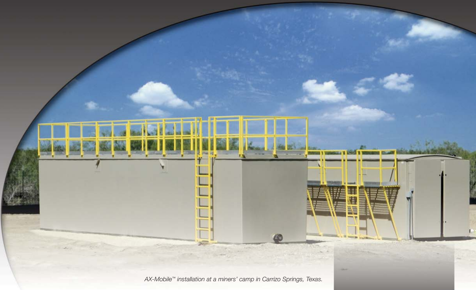
AX-Mobile™ installation at a miners' camp in Carrizo Springs, Texas.