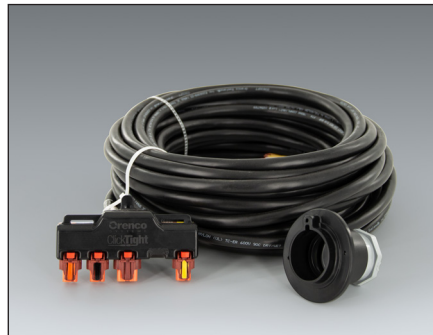
Connects one pump and up to four floats