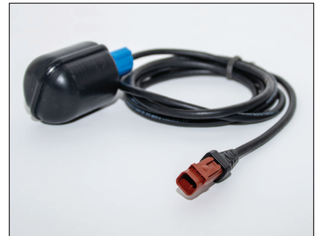
Clicks in place quickly and easily