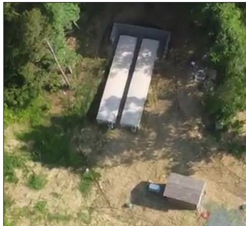
These AdvanTex AX-Max units are so easy to maintain that operator visits are only required every week – as opposed to the daily visits required for the old package plant.