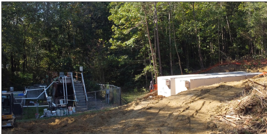
Because the AdvanTex AX-Max Wastewater Treatment System has a small footprint, these units (at right) could be installed while the old plant (at left) was still operating.