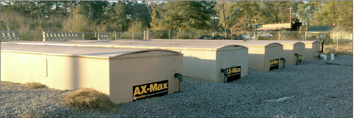
Although Fulton's five units are situated partially above-ground, the AX-Max™ can also be installed in-ground, as well as individually or in multi-tank arrays.

to becoming mayor in 1998. With a background in the field of water treatment, he knew there had to be better options for his city, so he began to research the possibilities. As he puts it, "When you're a small town without a lot of personnel, you just have to take care of things on your own."