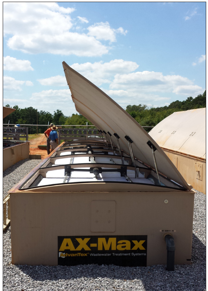
The AX-Max is a recirculating media filter that can produce outstanding effluent suitable for reuse.

“I’m familiar with the Orenco system,” he commented. “It’s a good design. I’m also familiar with the Orenco people. From what I know about Orenco, I would recommend it to other communities.”