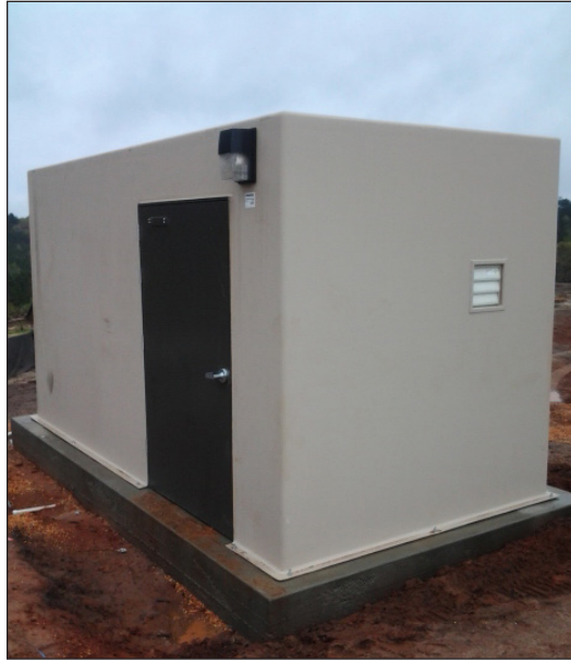
This fiberglass building houses Fulton's Phase II ultraviolet disinfection units. Available in numerous sizes, Orenco Fiberglass Buildings are insulated and sturdy, yet light enough to be easily transportable.