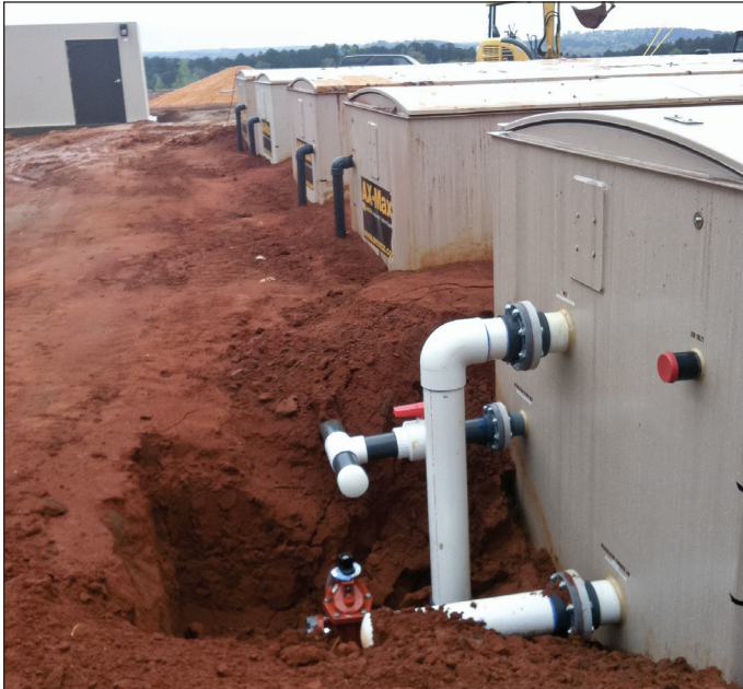
A fully plumbed and compact unit, the AX-Max is ideally suited for treating wastewater from commercial properties and communities.