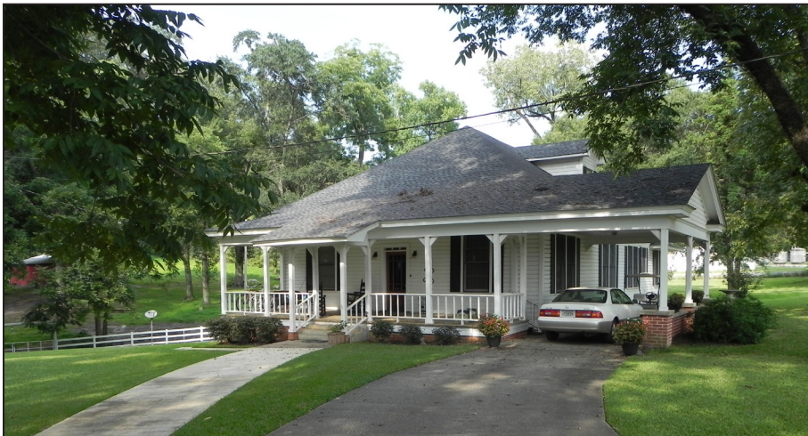
Residents of Fulton paid no fees for the on-lot portion of their Orenco Effluent Sewer, thanks to the diligence of their mayor in obtaining state and federal funding.

In a city with a population of almost 400, the residents of Fulton, Alabama seemed to be on their own when it came to solving the problem of failing septic systems and soil that wouldn't percolate. High groundwater levels are prevalent for 8-10 months of the year – especially in the low-lying areas along Bassett Creek, which carries water through Fulton and then south toward the Gulf of Mexico – and septic system failures were rampant. Frustrated residents had even resorted to draining wastewater from their homes straight into nearby ditches. Behind the Post Office, completely untreated sewage flowed into the creek.