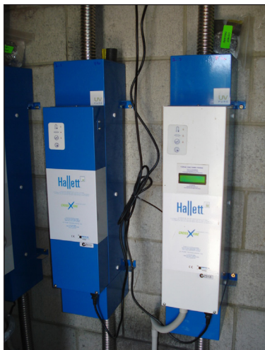
Hallett UV disinfection units are used for tertiary treatment.

For tertiary treatment, a fifth AX-Max is used as a polishing unit, followed by ultraviolet disinfection and land treatment (dispersal) with subsurface pressurized distribution lines.