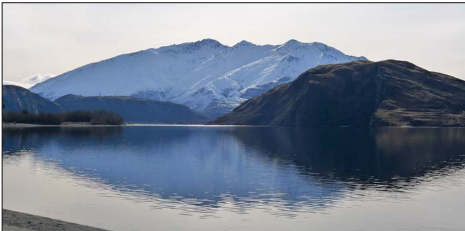
Glendhu Bay Holiday Park is situated on the shores of beautiful Lake Wanaka, New Zealand's fourth largest lake. The park has 400 campsites and lodging for 60.

Although Wanaka, New Zealand might rightly be called a winter vacation destination, it also boasts many year-round activities, such as sky-diving, hiking, fishing, and camping. Among the convenient camping facilities