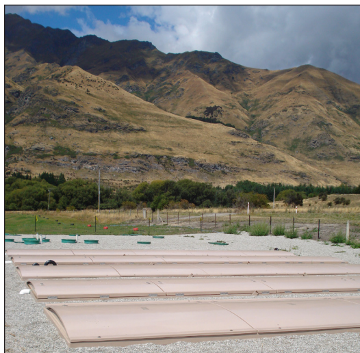
Whether installed above or below the ground, the sand-colored AX-Max units emit minimal noise or odor, so they draw no attention from passersby.

While enjoying the natural beauty of the area, Glendhu Bay’s many visitors appreciate the conveniences of the campground facilities without ever being aware of the sophisticated wastewater system that makes it all possible. And that’s just the way it should be.