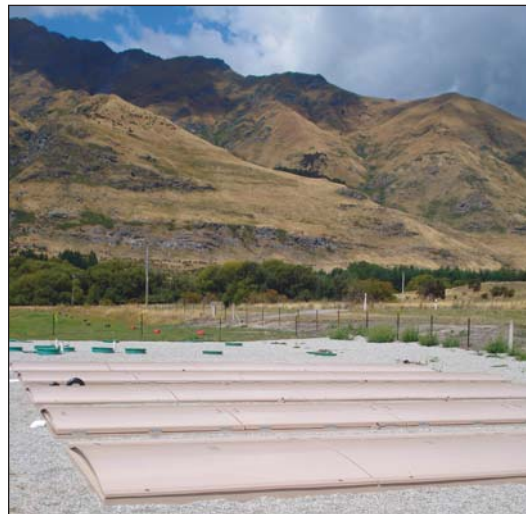
Whether installed above or below the ground, the sand-colored AX-Max units emit minimal noise or odor, so they draw no attention from passersby.

While enjoying the natural beauty of the area, Glendhu Bay’s many visitors appreciate the conveniences of the campground facilities without ever being aware of the sophisticated wastewater system that makes it all possible. And that is just the way it should be.