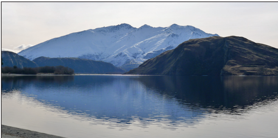
Glendhu Bay Holiday Park is situated on the shores of beautiful Lake Wanaka, New Zealand's fourth largest lake. The park has 400 campsites and lodging for 60 people.

Although Wanaka, New Zealand, might rightly be called a winter vacation destination, it also boasts many year-round activities, such as sky-diving, hiking, fishing, and camping. Among the convenient camping facilities nearby is Glendhu Bay Holiday Park, located on a scenic bay towards the southern end of Lake Wanaka. Amenities include a boat ramp, playground, showers, bathrooms, and a communal kitchen. The park offers more than 400 individual campsites, in addition to cabins and accommodation at the lodge.