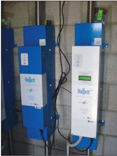
Hallett UV disinfection units are used for tertiary treatment.

For tertiary treatment, a fifth AX-Max is used as a polishing unit, followed by ultraviolet disinfection and land treatment (dispersal) with subsurface pressurized distribution lines.