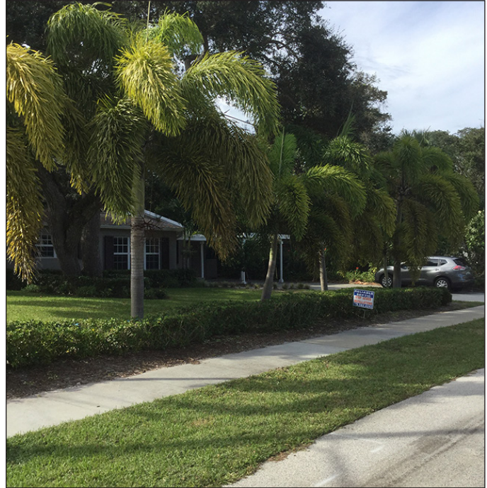
Further extending gravity sewer was too expensive and disruptive due to the small lots and mature trees common throughout Vero Beach.

The dramatically lower cost of an Orenco Effluent Sewer is largely attributed to its use of small-diameter mainlines laid at a constant depth to follow the contour of the land. Such mainlines are less time-