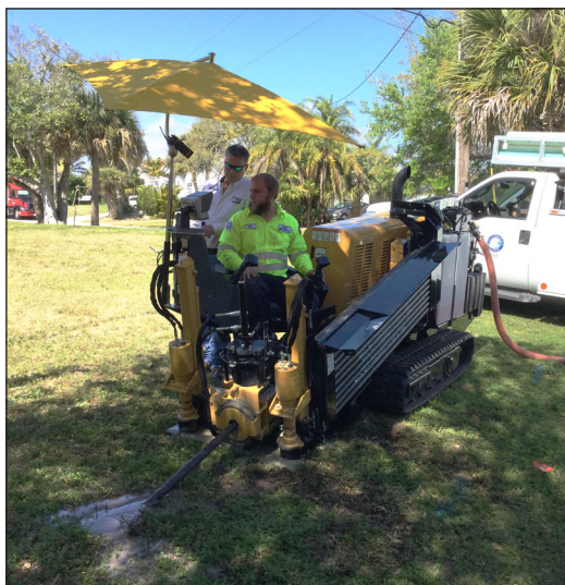
Trenchless construction is a less-intrusive method for installing new pipes while reducing negative environmental impacts and disruption to residents.

In Vero Beach, the minimal construction impact of the new Orenco Effluent Sewer was appreciated, especially considering that a significant percentage of the city's residential lots are located on narrow streets and contain large homes surrounded by mature and established live oak trees. In fact, a substantial number of homes that are expected to connect to the system are located on lots of 0.3 acres (.12 ha) or less. Table 1 shows lot size data for the Bethel Creek area, which is representative of the city.