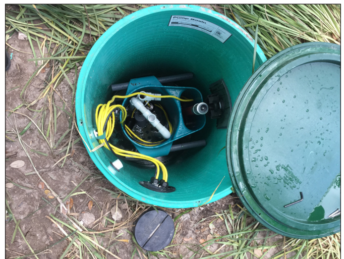
The city owns and operates the entire effluent sewer infrastructure, including the on-lot tank and pump package at each home.