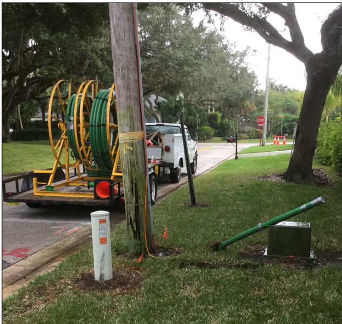
Orenco Effluent Sewers' affordability stems primarily from their use of small-diameter mainlines, which can be installed with minimal disturbance to neighborhoods.

According to Bolton, the installation time required for an effluent sewer system is less than a quarter of that required for a conventional gravity sewer. Directional boring (generally not possible for gravity sewer installations) was used in Vero Beach to minimize the impact of construction on both the public and the environment. This less-intrusive construction method reduces a number of unfavorable by-products of the construction process, including adverse environmental impacts, permitting concerns, problems with handling and disposing of excavated soils and groundwater, the number and cost of utility conflicts and resulting relocations, and the high costs of surface restoration. 4