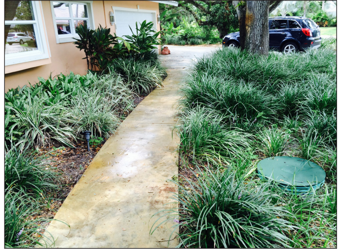
Each home connected to the system has an Orenco STEP package, including a 1,000-gal (3.8-m 3 ) watertight tank and an energy-efficient, low-horsepower pump that conveys effluent to the treatment plant.

Even though records of existing utilities are more accurate today than ever before, communities are still littered with unmarked and hidden electrical, gas, and telephone utilities. Gravity sewers, due to their larger construction zone and amount of excavated material, have a greater propensity for encountering existing utilities. The slope requirements of gravity sewers also make it challenging and costly to avoid existing utilities. The costs associated with existing utility conflicts include additional design costs, repair costs for inadvertently damaged utilities, and loss of production time while making the repairs. Conversely, effluent sewer mains can be easily rerouted to avoid existing utilities.