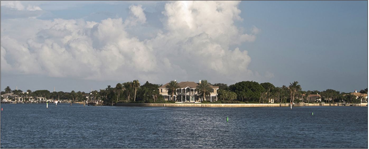
Connecting an estimated 1,500 residences to the city's new Orenco Effluent Sewer should dramatically improve water quality in the lagoon.