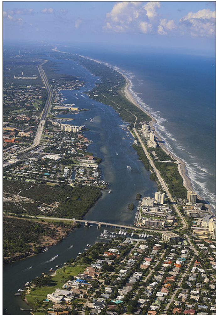
The total cost of installing an Orenco Effluent Sewer in Vero Beach was estimated to be half the cost of expanding the city's gravity sewer.

The first 2-inch (50-mm) collection lines and on-lot STEP packages were installed in the spring of 2015. A total of 1,500 residences are expected to opt in before the project is complete. The majority of homes will have a new, watertight 1,000-gallon (3,800-L) tank and STEP package installed at an estimated cost of $7,000 (installation plus materials) per connection. However, if a home was recently constructed and the city deems the existing septic tank to be watertight and structurally sound, the tank will be retained and the cost of construction will be reduced to about $5,600. In this case, the on-lot component design includes a simple, 100-gallon (380-L) pump chamber installed immediately following the existing tank (see photo at right). Once connected to the Orenco Effluent Sewer system, primary-treated effluent from each home's on-lot STEP package is pumped to the city's central wastewater treatment facility.