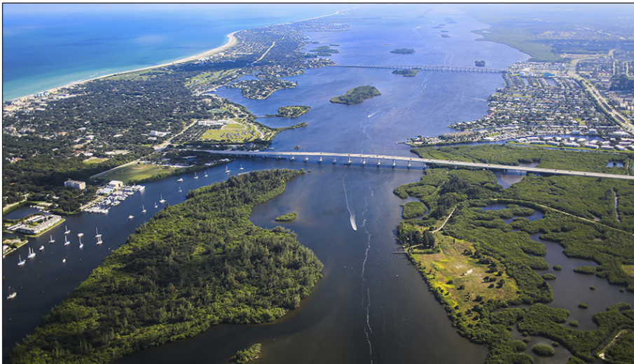
Concerned about nutrient runoff to the adjacent lagoon, the City of Vero Beach installed an Orenco Effluent Sewer, a much less-expensive and less-intrusive option than extending the city's gravity sewer.

Due to financial constraints, sewerage small cities like Vero Beach has long been an extreme challenge. For decades, engineers have encountered difficulties identifying affordable and viable wastewater solutions