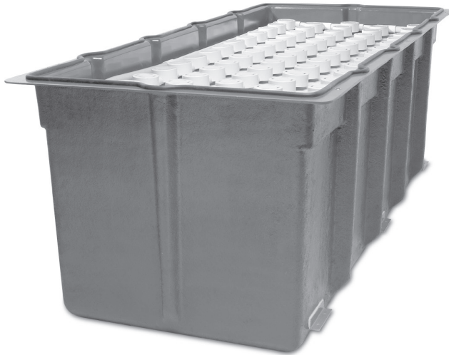
AdvanTex AX20 Textile Filter

Orenco's AdvanTex AX20 Treatment System is an innovative technology for onsite treatment. The heart of the system is the modular AdvanTex AX20 filter, a sturdy, watertight basin filled with an engineered textile material. This lightweight, highly absorbent textile material treats a tremendous amount of wastewater in a small space.