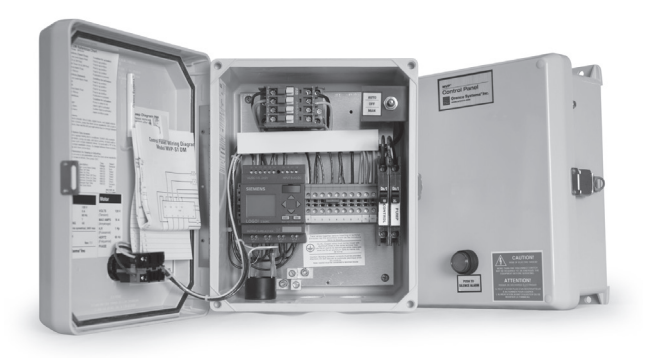
The MVP control panel (MVP-S1DM shown) accommodates both timed- and demanddosing

All MVP panels include an easy-to-use, programmable logic unit (PLU) that incorporates many timing and logic functions, such as multiple timing intervals to adjust for changing flow conditions and a built-in elapsed time meter and counter.