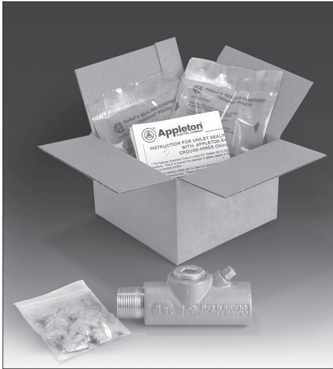
Conduit seal kit includes fitting, fiber, and cement

Orenco's Conduit Seal Kits create a watertight, gastight seal between a conduit and a splice box that prevents the passage of liquids, vapors, or flames.