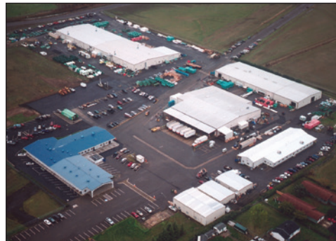
Orenco is headquartered at a 26-acre (10.5 ha) site in Oregon, a state that's known for its environmentally sustainable practices.

We maintain an environmental lab and employ dozens of civil, electrical, mechanical, and manufacturing engineers, as well as wastewater treatment system operators. Orenco's technologies are based on sound scientific principles of chemistry, biology, mechanical structure, and hydraulics. As a result, our research appears in numerous publications, and our engineers are regularly asked to give workshops and trainings.