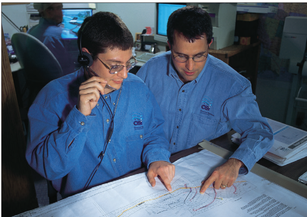
Our engineers offer unmatched technical assistance. Orenco's engineers and scientists have more than 500 years' experience in the water/wastewater industry.