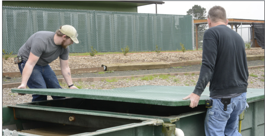
The lids on the AX100 were recently upgraded with Orenco’s current state-of-the-art lids, which have a foam core encased in fiber-reinforced polymer.

When the system was first installed, certified maintenance crews followed a strict monthly maintenance schedule to ensure everything worked properly. Now, after twelve years of successful operation, annual checks are all the AX100 needs. “Orenco has been great, and they are always very helpful when questions arise,” says Cyn Demers, development assistant at Saving Grace.