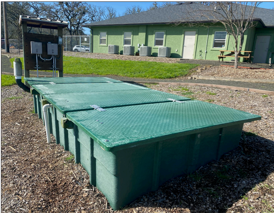
This AdvanTex AX100 Wastewater Treatment System has been ideal for the nonprofit facility because it fits in a small footprint, is easy to maintain, and has low electrical and life-cycle costs

In November 2011, Saving Grace Pet Adoption Center in Roseburg, Oregon, moved into a new, larger space that could handle its growing number of adoptable pets. The 13,000 ft 2 (1208 m 2 ) building includes a client intake area, cat and kitten rooms, dog halls with indoor/outdoor kennels, and a room filled with critter cages. It also has an in-house veterinary clinic, meet-and-greet rooms, and administrative offices for its 27 staff members and 531 volunteers.