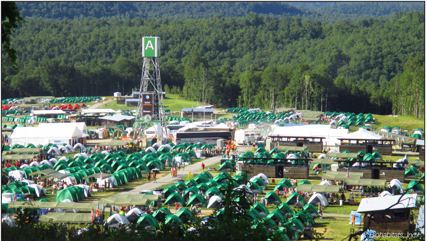
The AdvanTex Greywater Treatment Systems in place at the Summit Bechtel Reserve are an important part of the facility's overall sustainability. AdvanTex technology is known for its low energy use and for effective treatment, even with the highly variable flows common to camping areas.

After the effluent passes through the textile media,