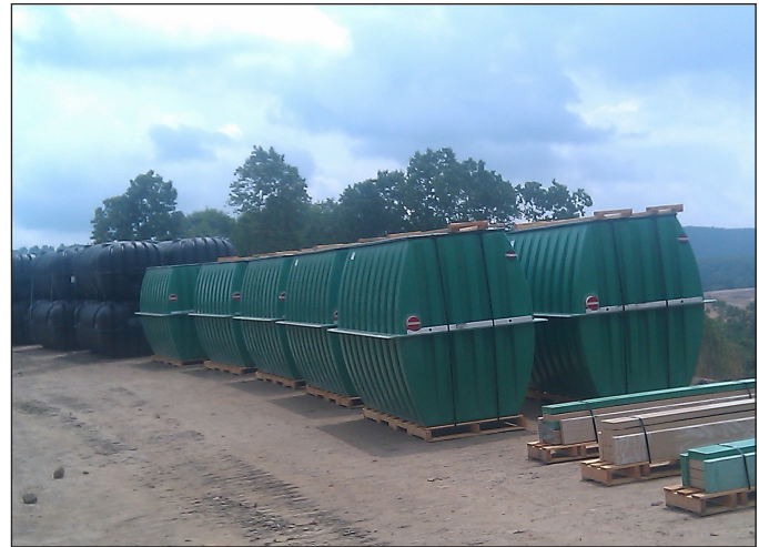
Engineers recommended these AdvanTex AX20-RT units due to the many advantages they offered, including a small footprint and a proven performance record for greywater treatment.

Both the AX20-RT and AX-Max greywater systems are pre-plumbed, “plug & play” units that are easy to install. The entire system – including treatment, recirculation, and discharge – is built inside a fiberglass tank. This simple design reduces costs not only for the initial excavation and installation, but also for ongoing operation and maintenance.