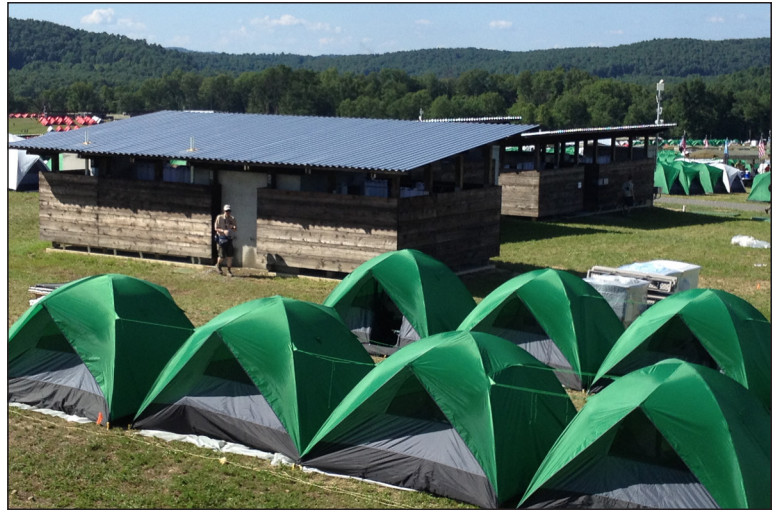
Shower facilities like these provide the greywater that is treated for reuse in toilet flushing.

Another advantage of the AdvanTex textile is its large amount of void space, which allows for greater movement of air as well as more room for the accumulation of inorganic solids. In addition, the