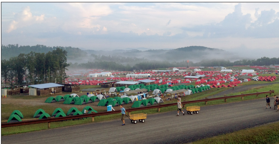
At the Boy Scouts of America's National Jamboree site, AdvanTex Treatment Systems from Orenco treat up to 200,000 gpd of greywater for reuse.

Boy Scouting places great emphasis on environmental stewardship. In fact, one of the requirements for becoming an Eagle Scout is earning either the “Environmental Science” or “Sustainability” merit badge. In