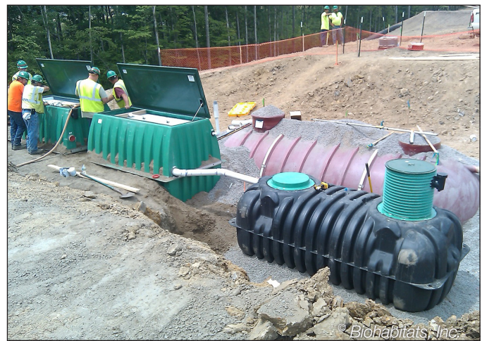
Treated greywater flows from the green AX20-RT units into the black dose tank and then to a UV disinfection unit. (The red tank in the background treats blackwater.)

In addition, AdvanTex units are known for their energy savings. They use highly efficient ½-hp (0.37- kW), 115-volt pumps that consume fewer than 2 kWh per 1,000 treated gallons 1 (3.8 m 3 ). For the AX-RT, that typically equals just $2-3/month, depending on local electricity rates.