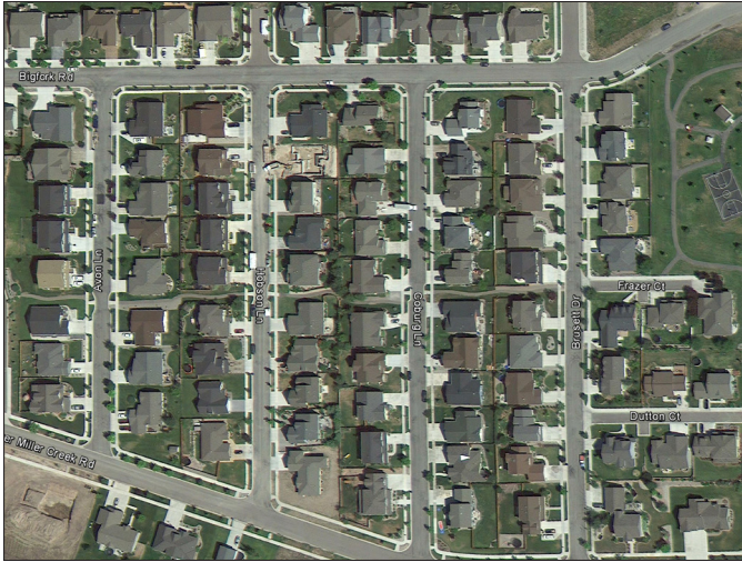
Figure 10. Missoula, MT