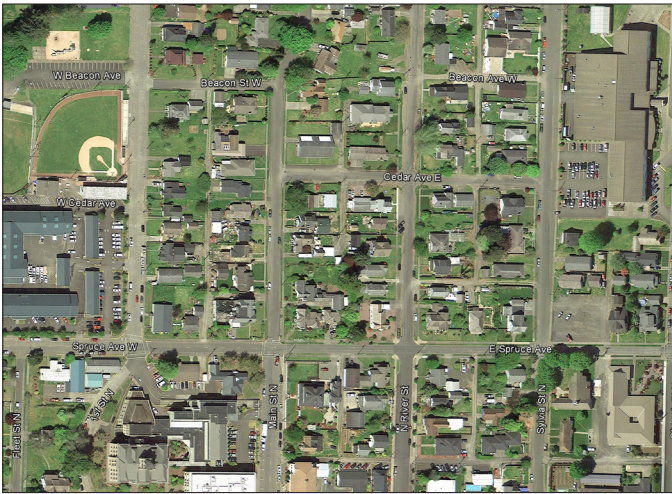
Figure 9. Montesano, WA