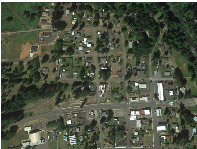
Figure 12. Elkton, OR

Installed in 2013, Coburg's Orenco Sewer system consists of 420 connections, including a large contingent of commercial businesses and mobile home parks. The older part of the city is comprised of small lots, established trees, and limited usable area for tank installation.