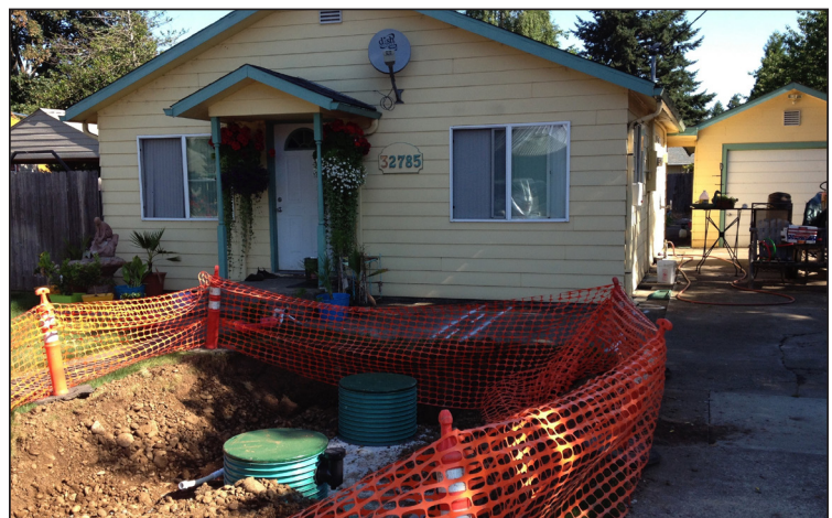
Figure 6. STEP system installation on 6,000 ft 2 (557 m 2 ) parcel

Gravity sewer laterals, in contrast, are laid at a constant slope and often require deep excavations to tie into the deeply excavated sewer main. Gravity sewer on-lot pipe installation is typically installed by sloping the sides of the trenches for earth stability. Though this eliminates the need for trench boxes, it increases the overall construction footprint on private property. The overall on-lot construction impact of installing a gravity sewer lateral alone often exceeds that of an Orenco Sewer or grinder sewer. xiii