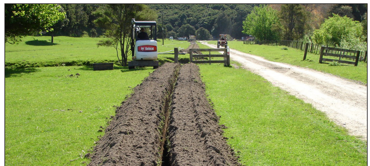
Figure 1. Typical open-trench construction