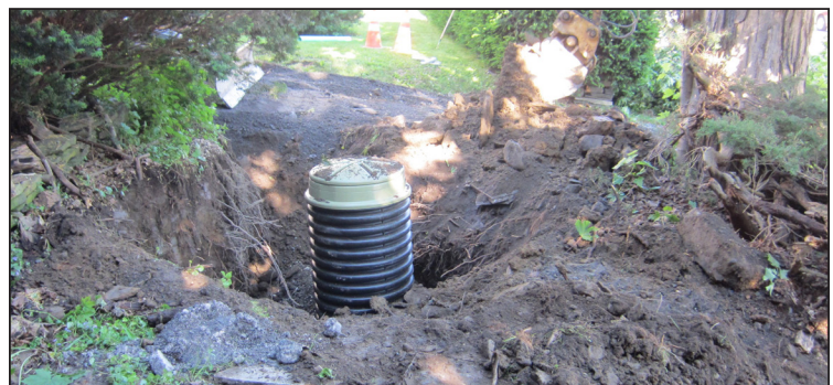
Figure 7. Grinder sewer basin installation