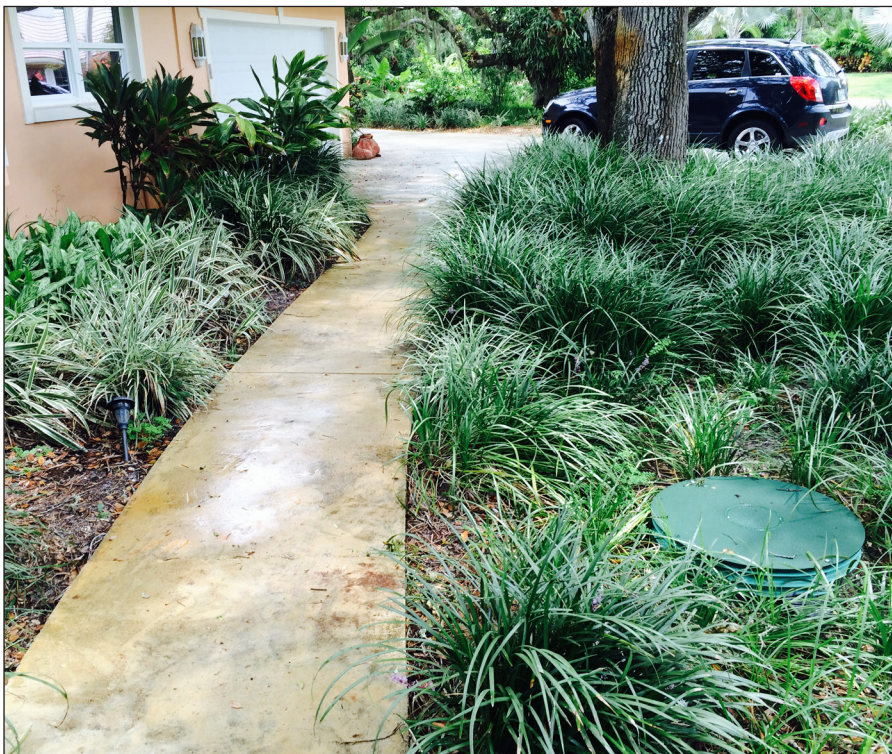
Figure 8. On-lot Orenco STEP package installed in Vero Beach, Florida

The usable area available to install the tank depends on the overall parcel area minus the area associated with impervious surfaces, set-