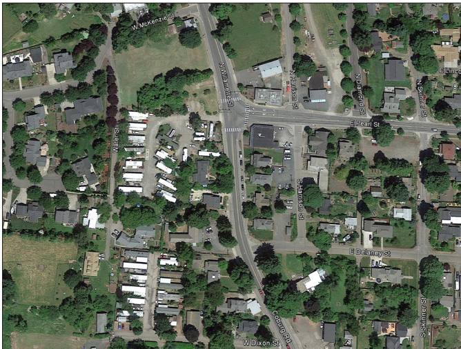
Figure 11. Coburg, OR

Beginning in 1995, Missoula installed an Orenco Sewer with 1,300 Septic Tank Effluent Pump (“STEP”) packages to replace existing onsite septic systems that were failing. The city continues to replace failing systems as needed with STEP packages and now has over 1,700 total packages installed. In the older parts of the city, the average lot size is less than 6,000 ft 2 (557.4 m 2 ), and the tank burial depth is typically greater than 6 ft (1.83 m).