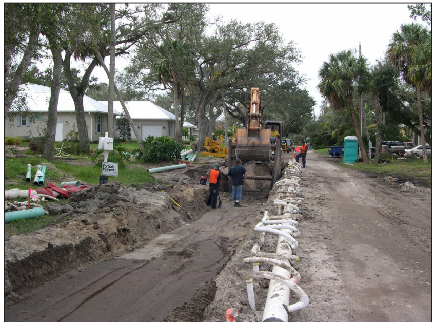
Figure 5. Gravity sewer mainline installation