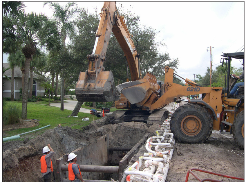
Figure 4. Gravity sewer mainline excavation

Backfilling of the gravity sewer trench is particularly important when considering the location of the pipe underneath road surfaces. Specific construction methods for backfilling and compaction aren't covered in this document, but vary based upon the width of the trench, excavated material characteristics, and the degree of compac-