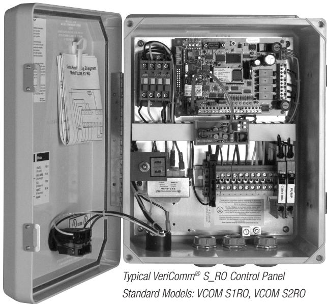
Typical VeriComm® S 1 RO Control Panel Standard Models: VCOM S1RO, VCOM S2RO

VeriComm® S1RO and S2RO remote telemetry control panels are used with on-demand simplex pumping operations. Coupled with the web-based VeriComm Monitoring System, these affordable control panels give wastewater system operators and maintenance organizations the ability to monitor and control each individual system's performance remotely, with real-time efficiency, while remaining invisible to the homeowner.