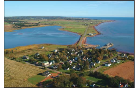
Victoria, Prince Edward Island, Canada