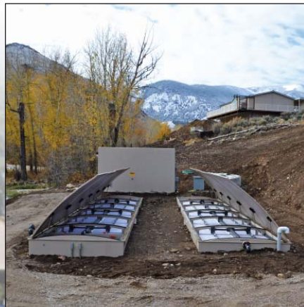
Living Waters Ranch, Idaho