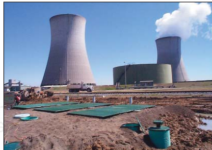
Entergy, White Bluff, Arkansas