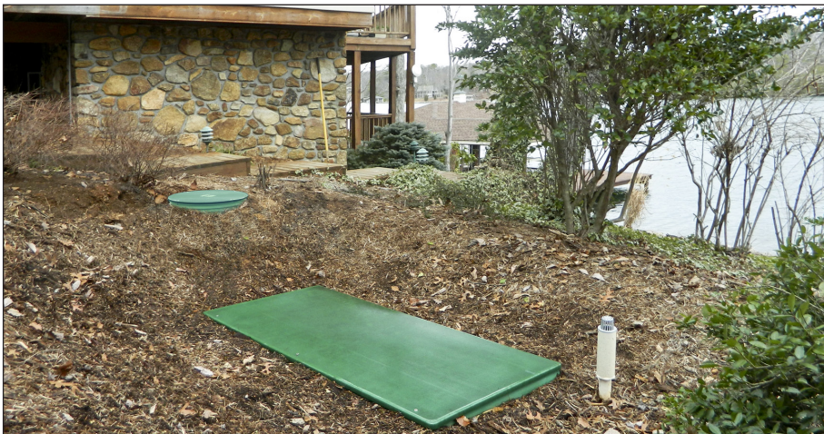
In this typical AX20-RT system installation, note the system's small footprint. The AX20-RT measures 8.5 x 6 x 5.2 ft (2.6 x 1.8 x 1.6 m).

The homeowners were extremely concerned because they would not be able to stay in their home without a functioning drainfield. The North Carolina Department of Water Quality (DWQ) wanted to help the homeowners find a solution. However, to maintain public health, the DWQ had to ensure that any new system could meet local NPDES (National Pollutant Discharge Elimination System) standards.