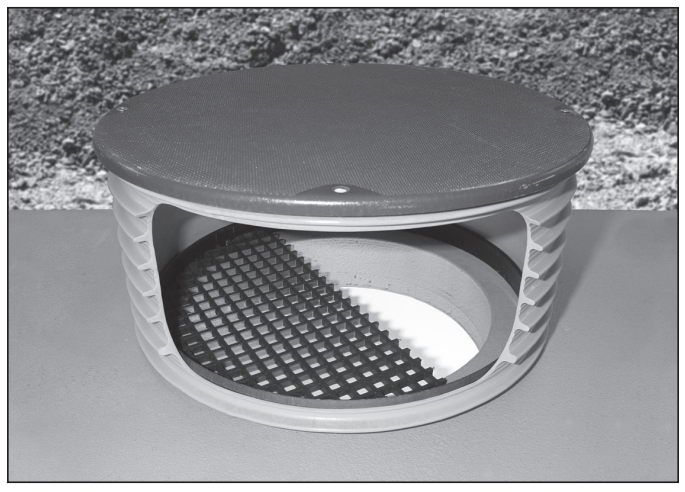
Properly installed, the riser safety grate rests between the access riser and the tank opening. (Cutaway riser and cutaway grate shown for display purposes.)